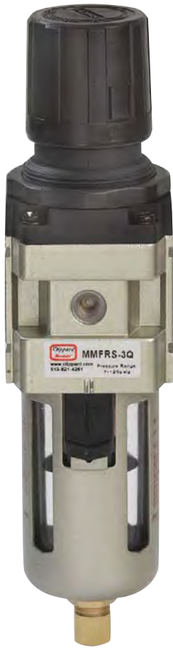
MMFRS-3Q Stacking Filter-Regulator with Bowl Shield & Semi- Automatic Drain