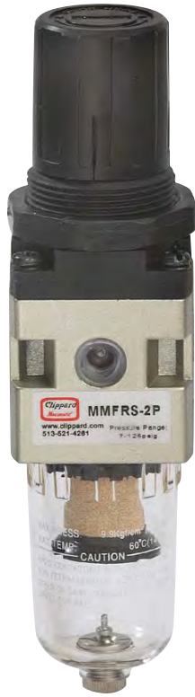
MMFRS-2P Stacking Filter-Regulator with Polycarbonate Bowl & Manual Drain